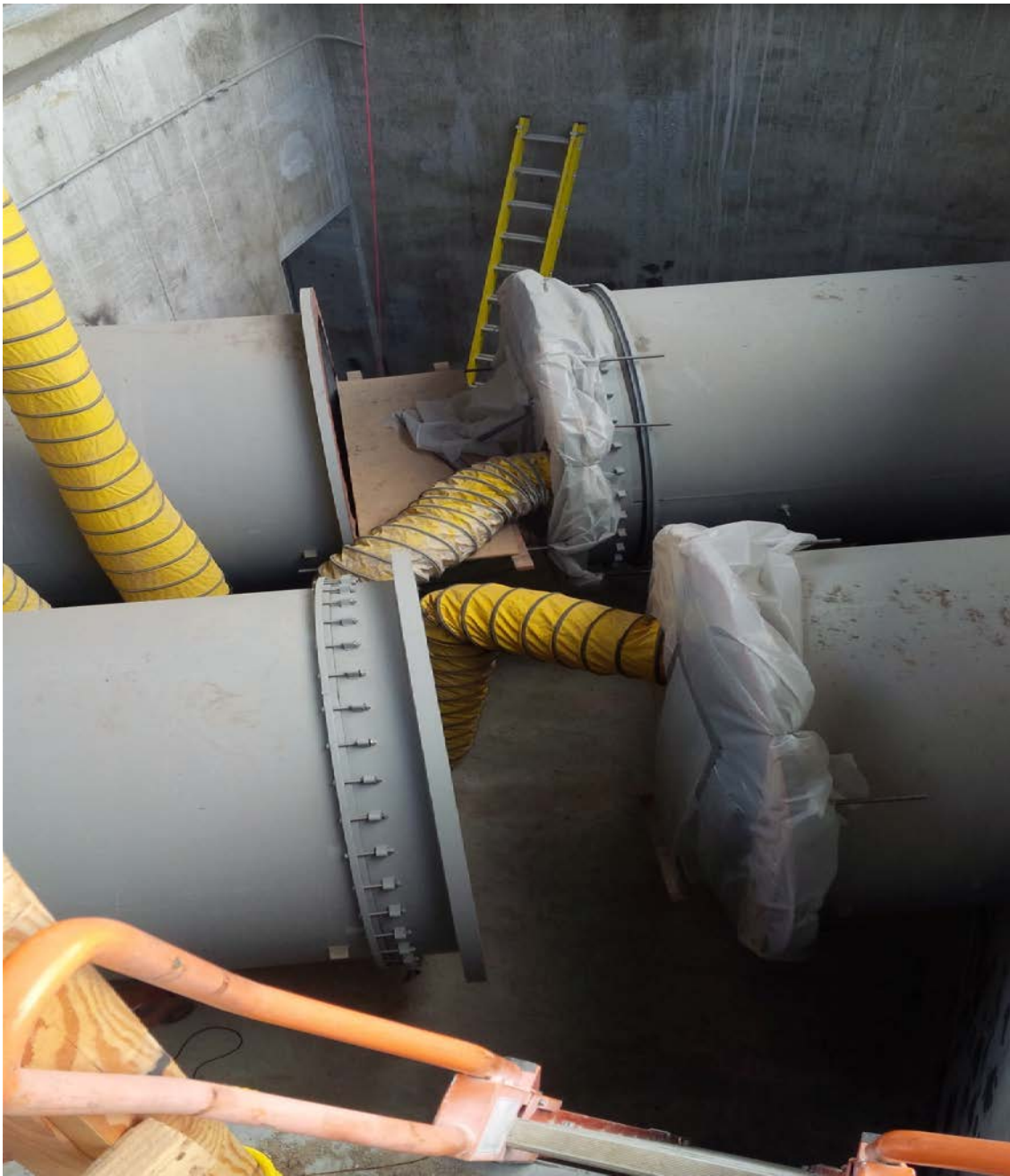
Don't forget to connect the pipes.